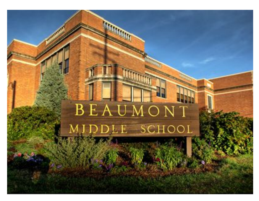
2021 is a Year for Resilience, Hope, and Unity

The Beaumont Foundation wishes you a happy new year. We feel a renewed sense of energy to support our teachers, students, and school in this tumultuous time. Please join us in raising money to keep our school programming and educational staffing funded to help every Beaumont student stay engaged and supported. The Beaumont Foundation, which raises money for school staffing, needs you. If you are able, please consider making a monthly donation of $15, $20, $30 or more. One time donations are also helpful in any amount. Check with your employer regarding matching donations for an even bigger impact!